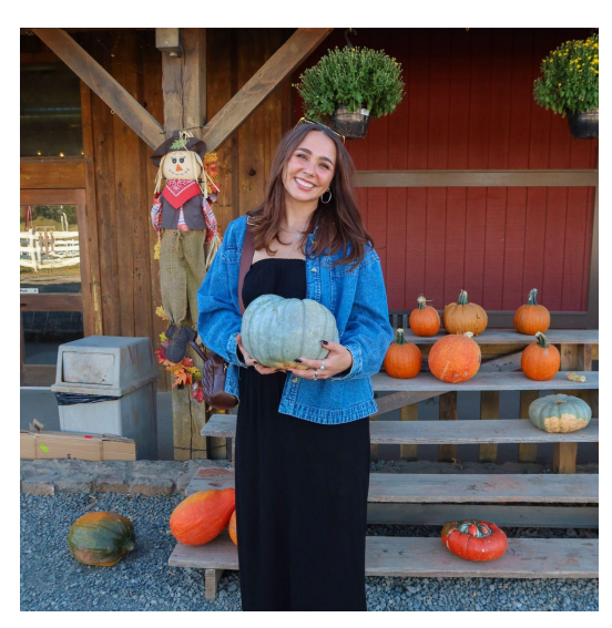
Algebra 1/Economics & Personal Finance Teacher